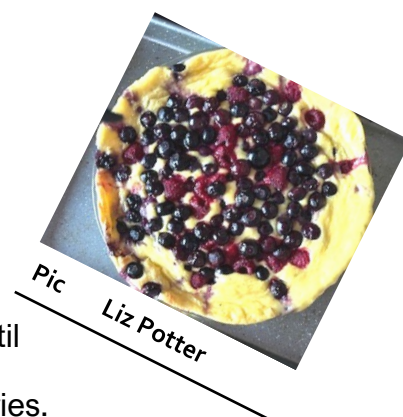
Pic Liz Potter