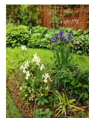
Ed's own garden