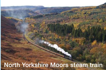
North Yorkshire Moors steam train