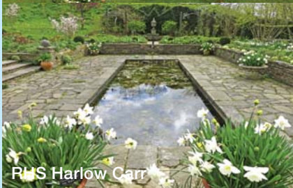
RHS Harlow Carr