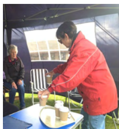
Warming up the helpers!