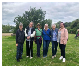
A team of walkers, unnamed