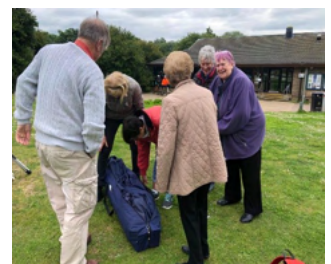
Beating the gazebo into submission