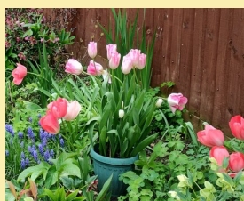
Pic: Ed's own WI bulbs