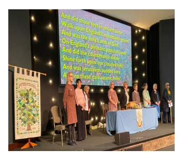
Board Members & Jerusalem!