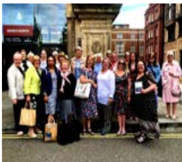
Just a few of us!