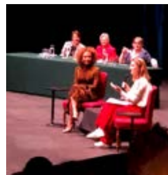
Mel B & Victoria Derbyshire