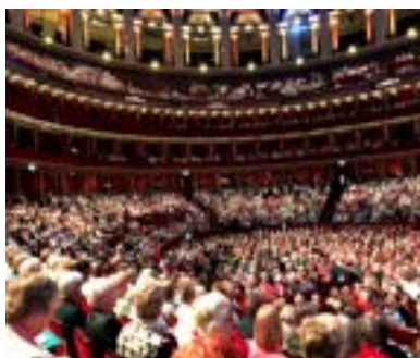
A very full Royal Albert Hall