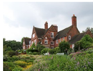
Winterbourne House & Gardens

Thank you to the members who did contact us with new ideas which we have discussed and are looking into. Keep the ideas coming or even better, come and join the committee; our next meeting is Tuesday 30 th January 2024 at WI House 10.30am. Hope to meet up with you at any of our events.