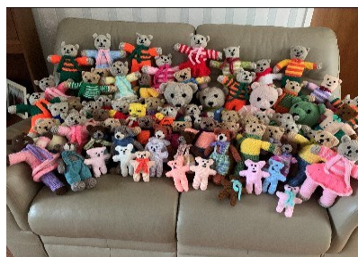
Amphill's Magnificent 74!