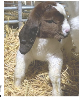
Another lovely sign of spring: Not a lamb, but a Baby Goat!

This year we have a wide mixture of events coming up from crochet days at the house to horse racing in July together with a wine tasting evening. Proms in September a little earlier this year to fit with the National Proms happenings, and hope from last years response to this event, we will have a full house! In the autumn we have a London visit to include the Guild Hall and lunch in a London Pub! We have even included exercise this year in the form of the fundraising Walk around Priory Park! We hope there is something for all the different tastes of WI Members and Friends. The sub committees, your Board of Trustees and MAC, work hard to ensure a variety of events, some for learning and some just for enjoyment, and those above are not an exhaustive list - there are many other events, we even have a plan for January 2025!